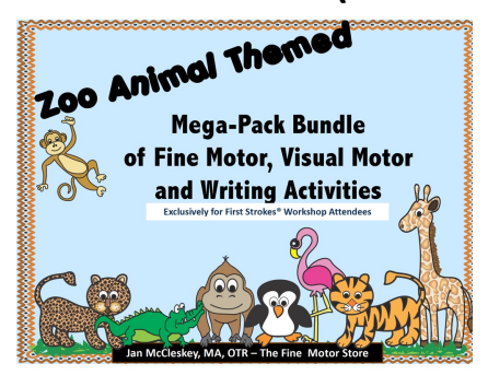
Zoo animal mega pack of 200 fine motor labs.