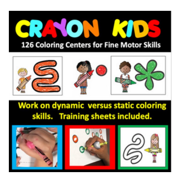
Coloring warm-ups for pre-k through st grade