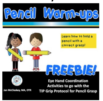
Pencil warm-ups for K - elementary